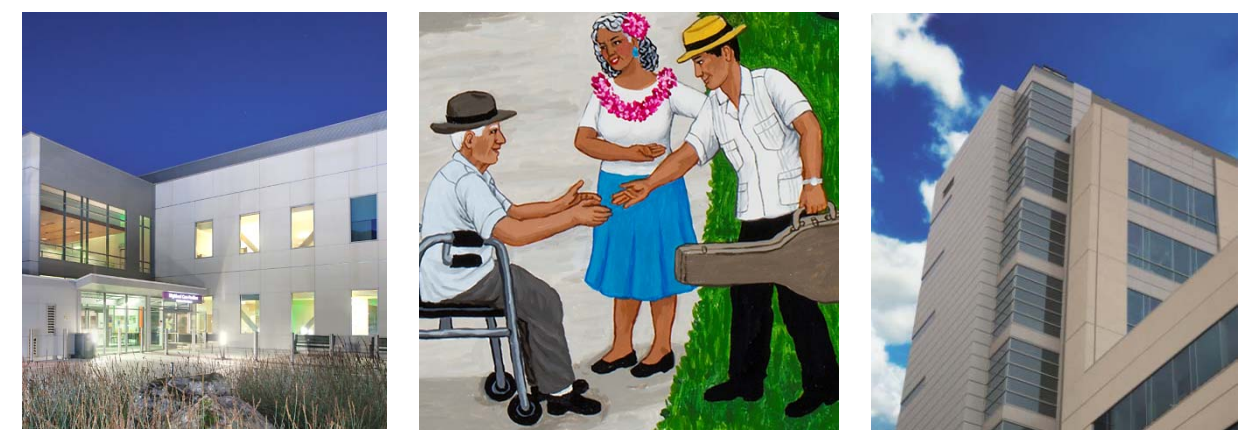
In April 2016, the Highland Acute Care Tower opened to the public. The Tower is a 9-story centerpiece of the $668 million, multi-year project to modernize the historic Highland campus. It houses inpatient services, a family birthing center, a Neonatal Intensive Care Unit, a state-of-the art Diagnostic Imaging Service Center, physical/occupational/speech therapy suites, a technologically advanced laboratory, as well as predominantly private rooms with views of Oakland.